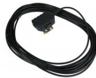
TA-22B Item number: 1008140225