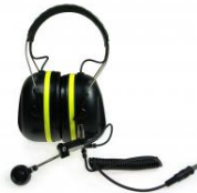
AK5850HS Item number: AK5850HS